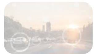
IoT/loV & Optoelectronics