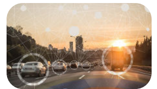
IoT/IoV & Optoelectronics